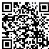
View our menu

Just go to www.maggiosrestaurant.com , download our app to your smart phone or iPad and place your take out or delivery order. You can order from our website or facebook page too!