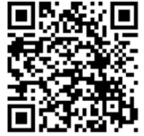
View our menu

Just go to www.maggiosrestaurant.com , download our app to your smart phone or iPad and place your take out or delivery order. You can order from our website too.